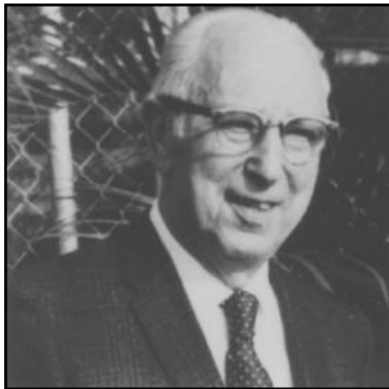
JOSEPH G. ROGERS

The creator of the statue is Daniel Gluck, whose abstract religious and sports sculptures (including the Brian Piccolo Award) are now on view in many public places around the United States. The beautifully sculptured award of bronze and marble stands over four feet in height, weight nearly 1,000 pounds and has a mounted swimming figure that stretches nearly four feet in length.